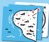
20 Expansion Tiles (marked with a red arrow)