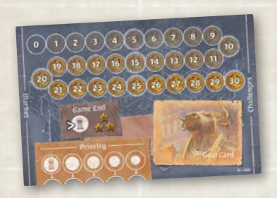
1 TRACKING BOARD