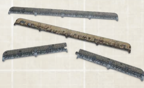
5 DUNGEON FRAMES (assembled from 2 tokens)