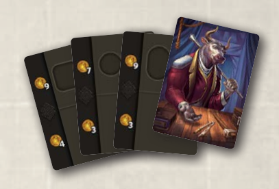
18 MARKET CARDS