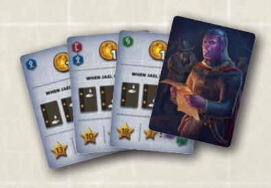
9 JAEL CARDS (solo play)