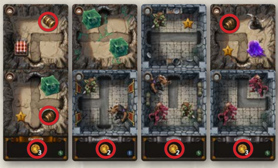
Example: The player receives 13 gold: ten (3 + 2 + 2 + 3) for their chamber cards and three for their treasure chest icons.

Move each player's tracking marker on the gold track to the space equal to their total. If a player has more than 30 gold, place their marker on the 30 space.