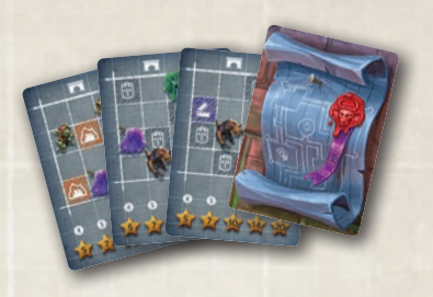
8 BLUEPRINT CARDS