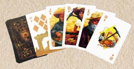
20 Playing cards (10, J, Q, K, A of four poker suits)