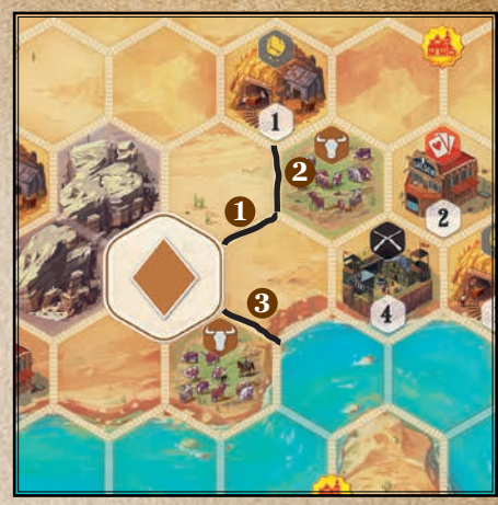
Example: After choosing to use the Queen of Diamonds and writing the value of the card at the bottom of the sheet, 3 tracks are then drawn from the Diamonds station.

A feature can be activated with tracks from multiple railway lines. But those lines must not touch each other.