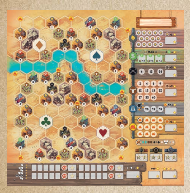
1 pad of 80 sheets